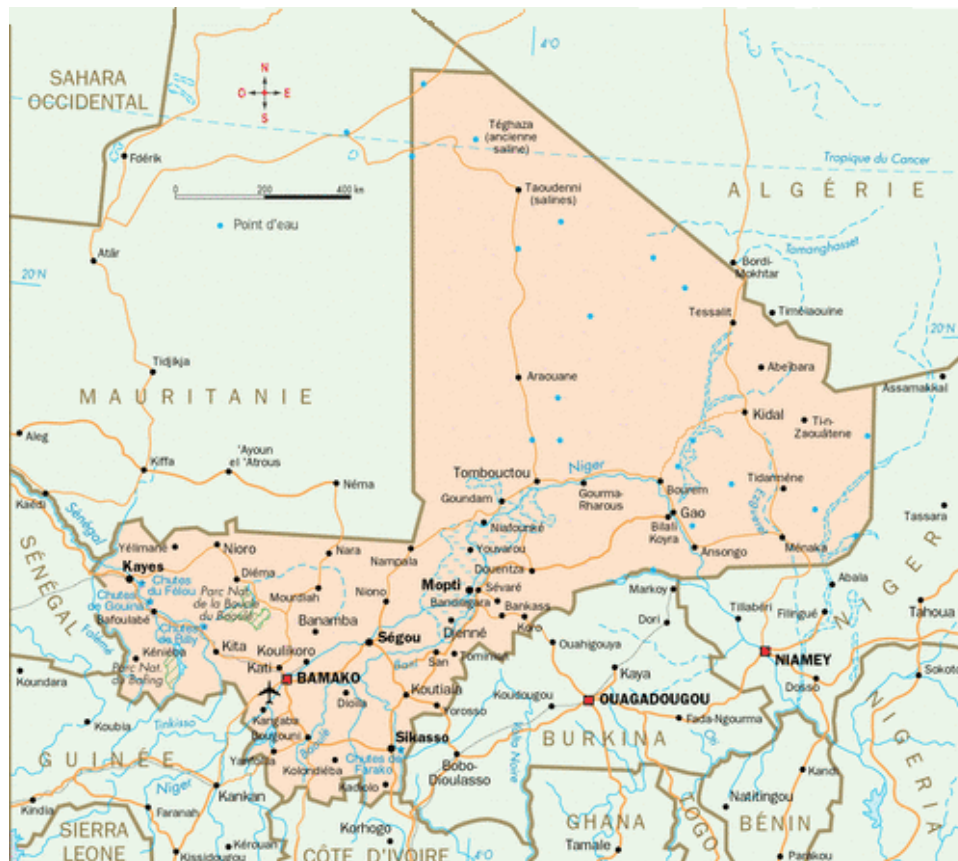
Map 1. Mali